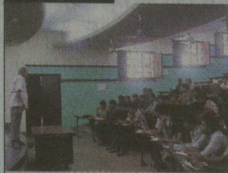
A class in progress at IIT Kharagpur.

THE COUNTRY'S ELITE HIGHER EDUCATION INSTITUTIONS ARE FACING ACUTE STAFF SHORTAGE